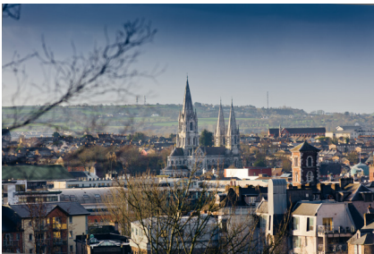
City of Cork, Ireland