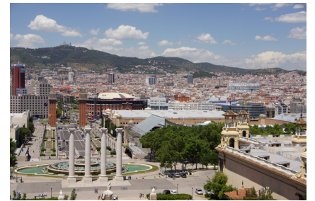
Barcelona Metropolitan Area, Catalonia/Spain

5 pilot regions establish One-Stop-Shops that provide support for collective local action and the creation of energy communities, thus enabling greater citizen participation in the energy transition.