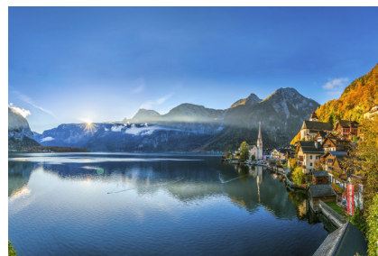
Region of Upper Austria, Austria