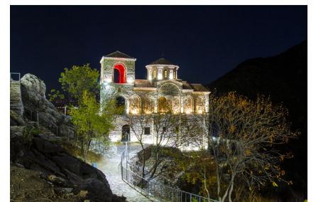
Municipality of Asenovgrad, Bulgaria